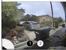
(Above) A screen shot of a Spring Knolls home's trash cans on the WM account page after an April 25 pickup.

Picked Up Thu, 04/25/24 | 1:56 pm ✔ Pickup Completed Missed Pickup