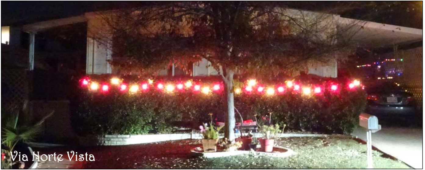
Via Norte Vista