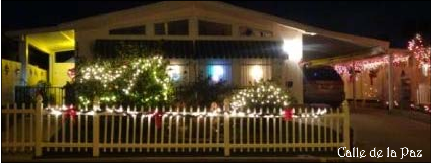
Callę de la Paz