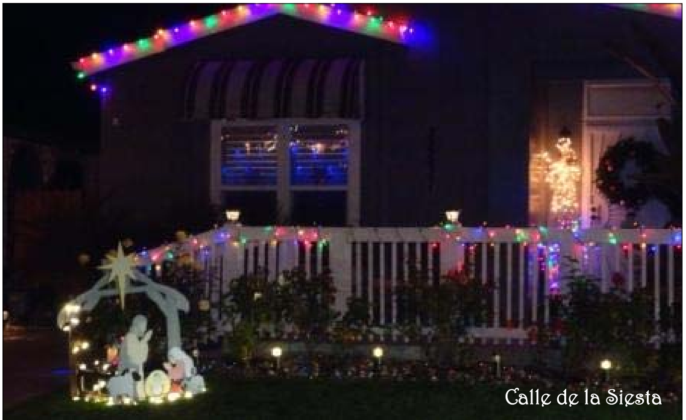
Calle de la Sista