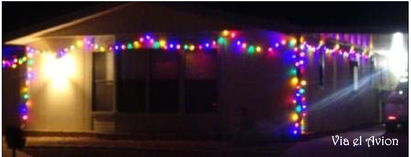
Via el Avion