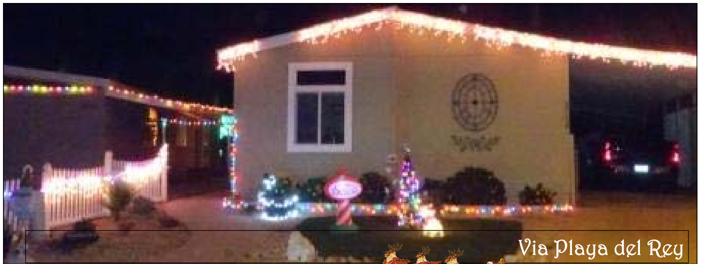
Via Playa del Rey