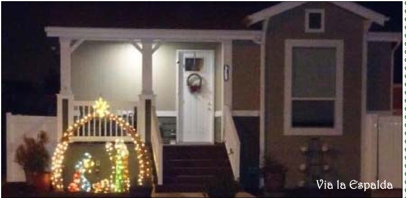
Via la Espalda