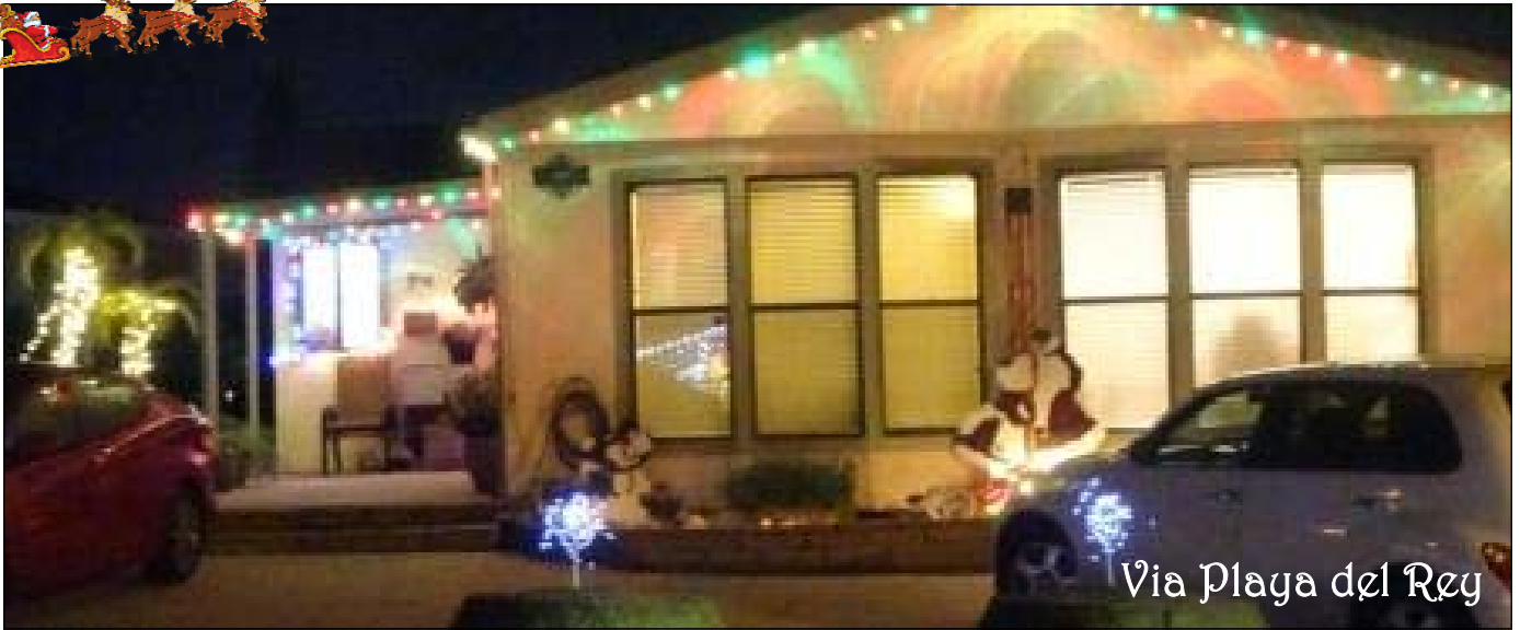
Via Playa del Rey