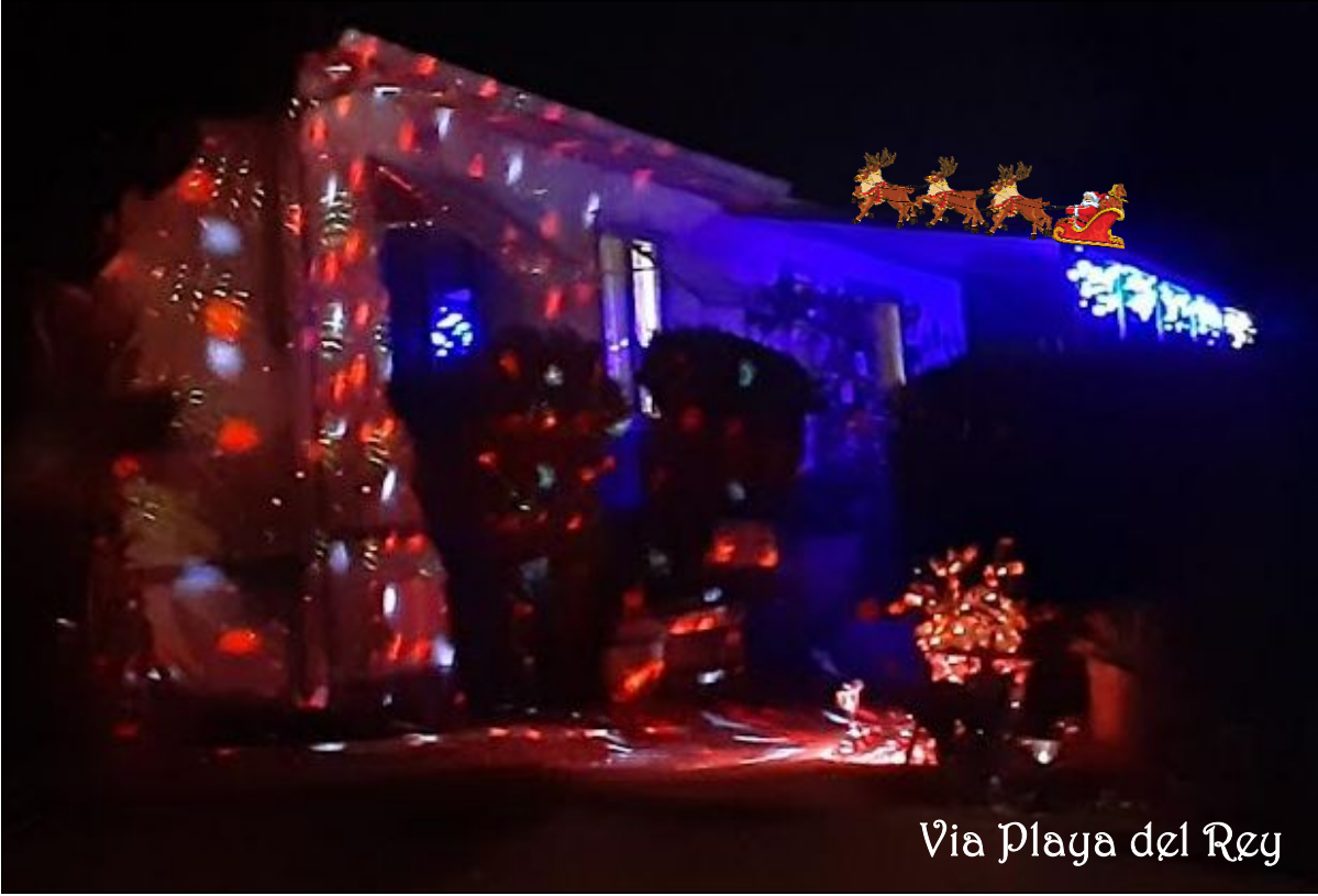
Via Playa del Rey