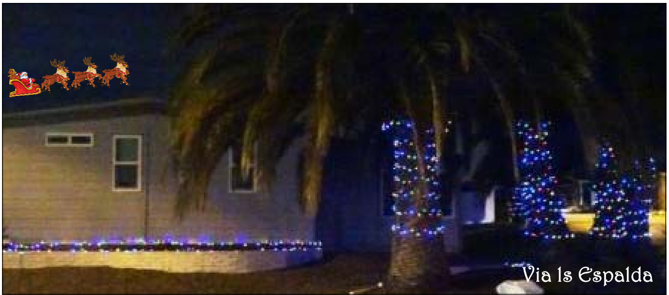
Via 1s Espalda