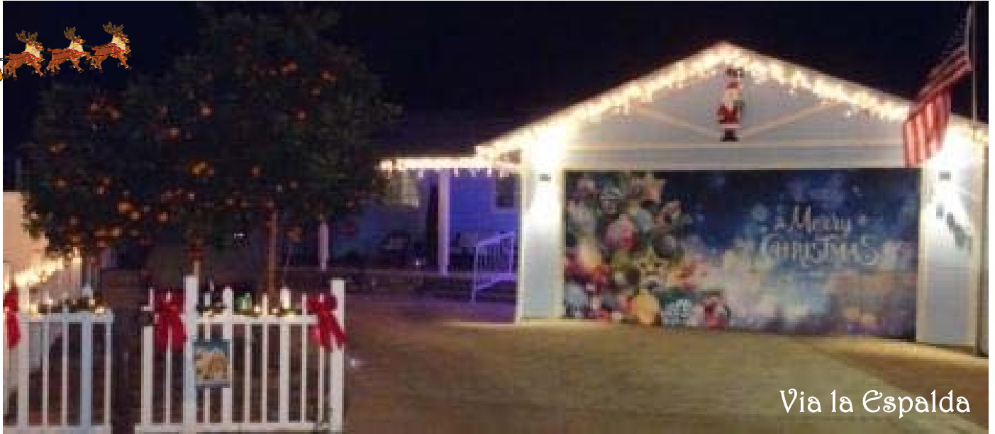
Via la Espalda