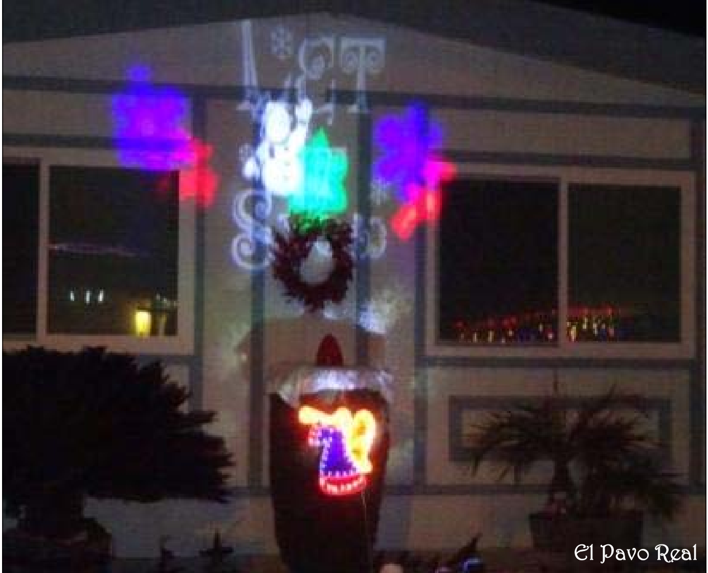
El Pavo Real