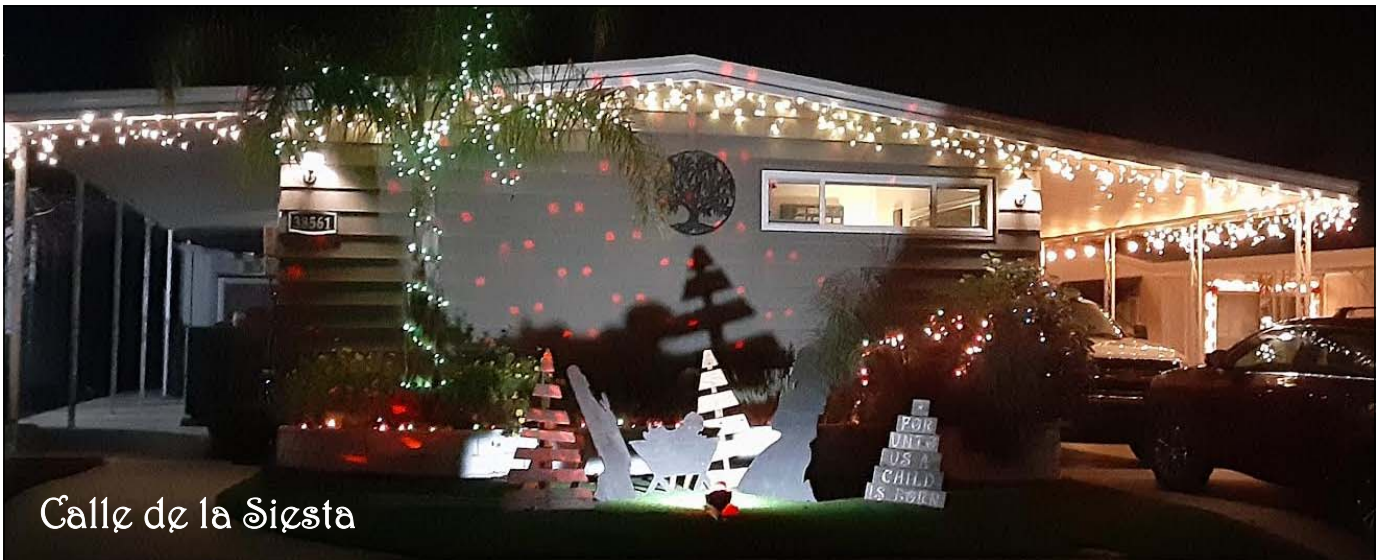
Calle de la Sista