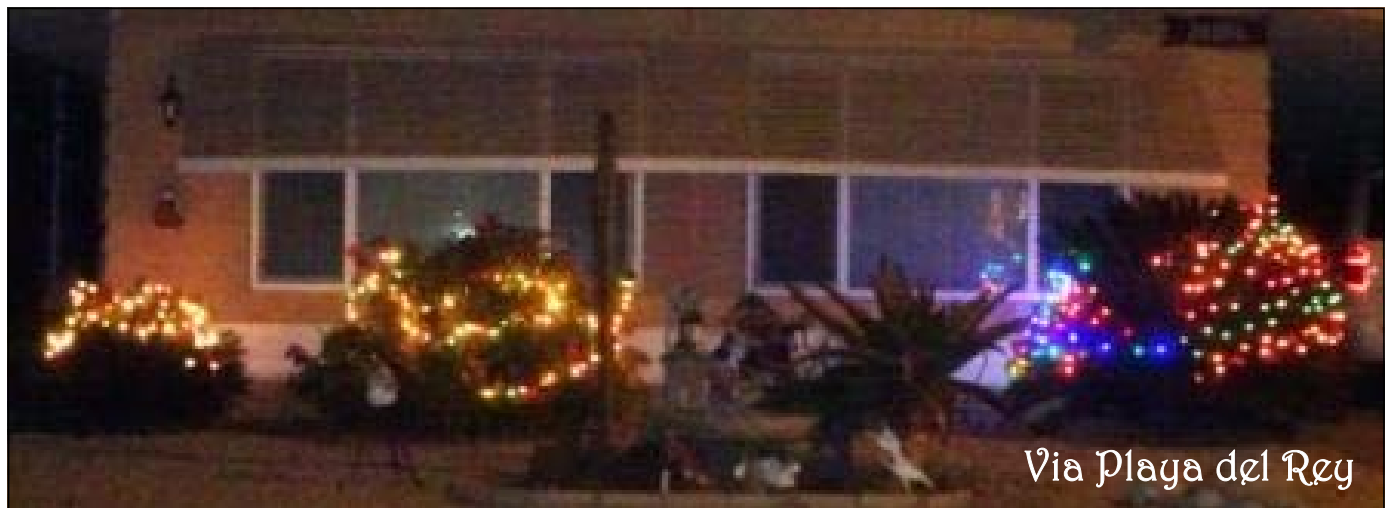
Via Playa del Rey