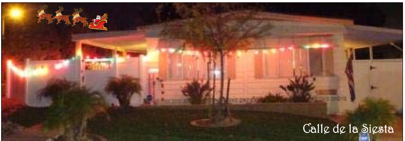
Calle de la Siesta