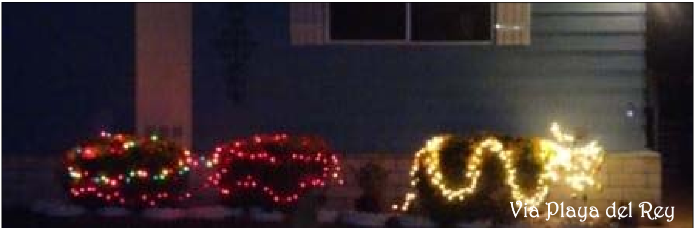
Via Playa del Rey