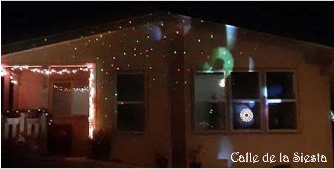
Callè de la Siçsta