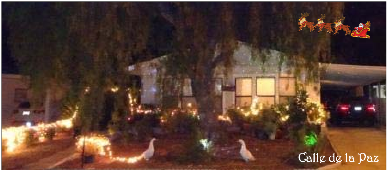
Calle de la Paz