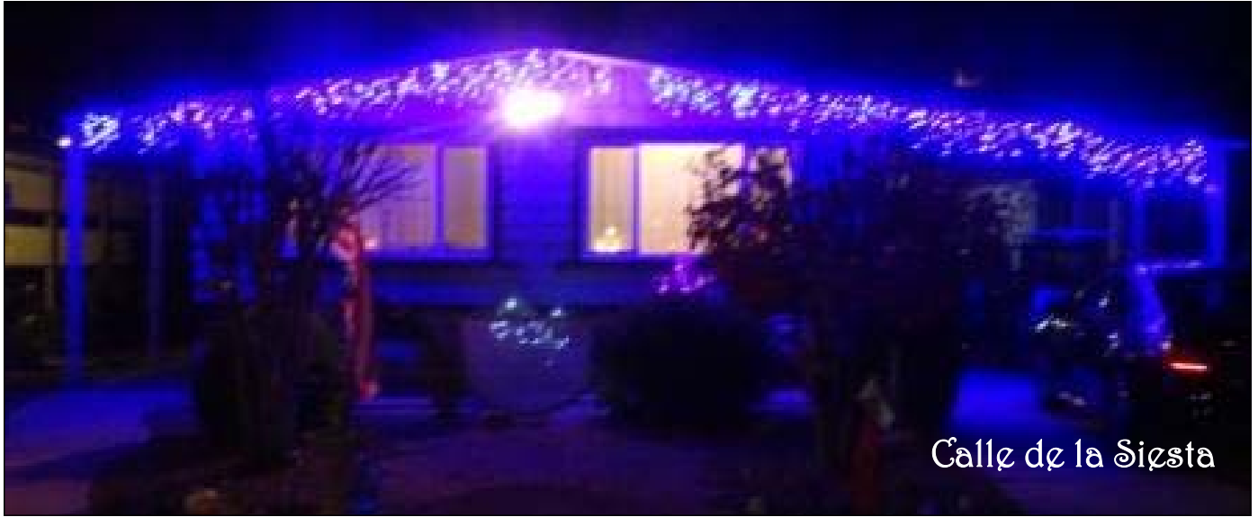
Callę dz la Sizsta