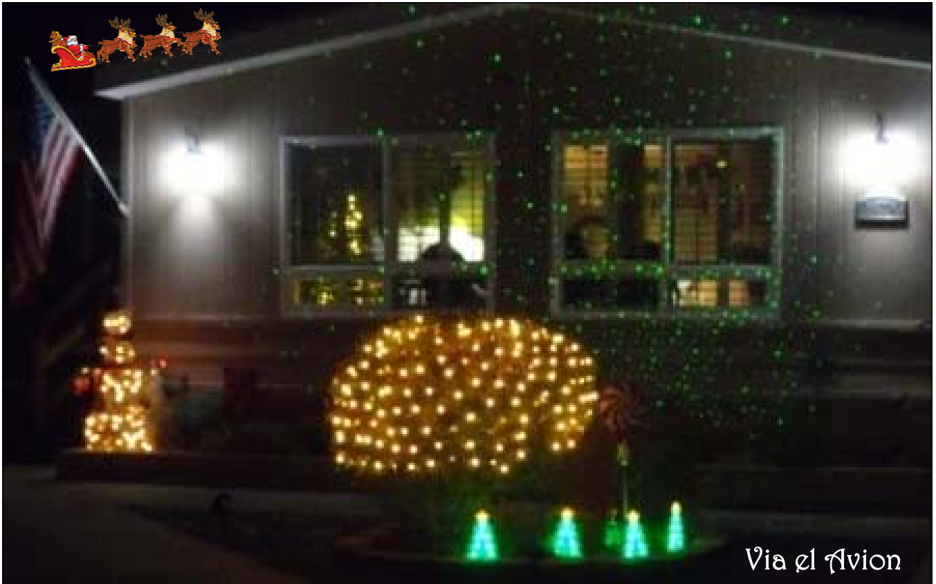
Via el Avion