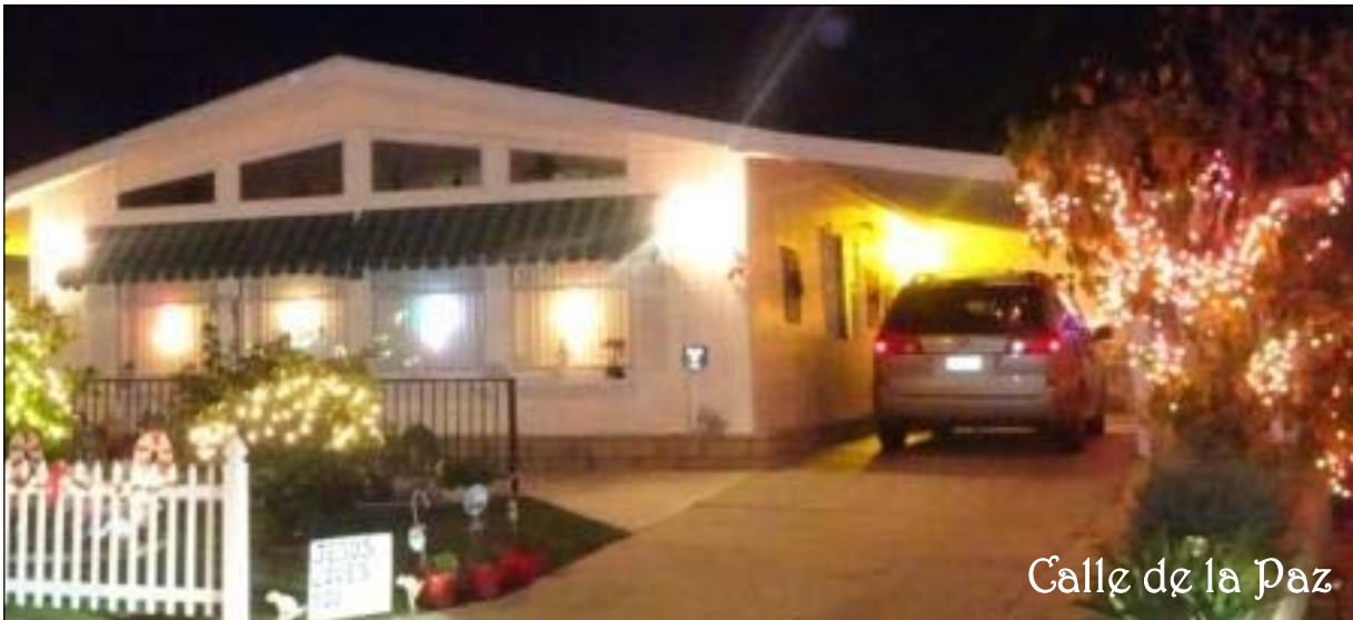
Calle de la Paz