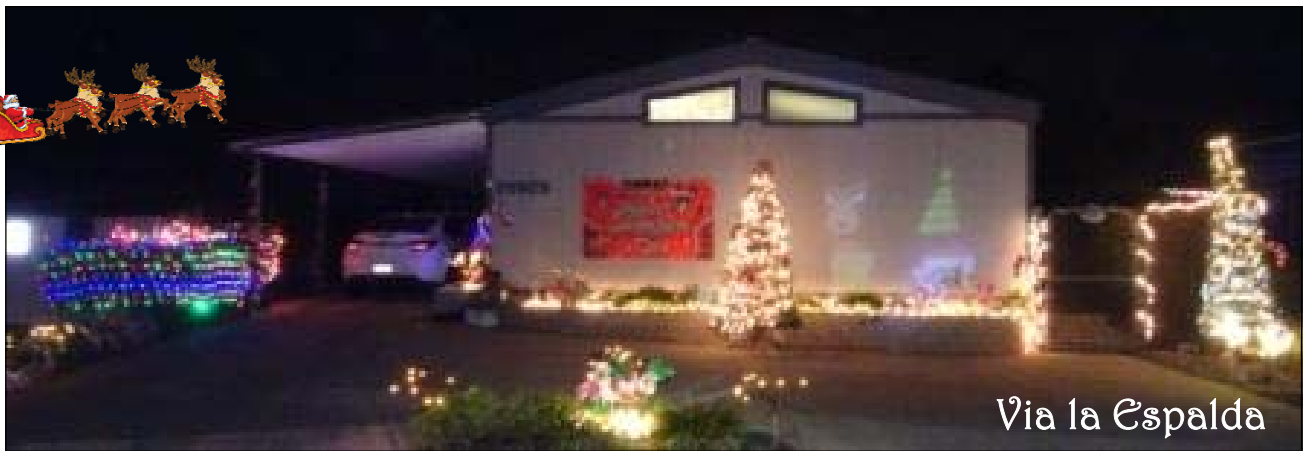
Via la Espalda