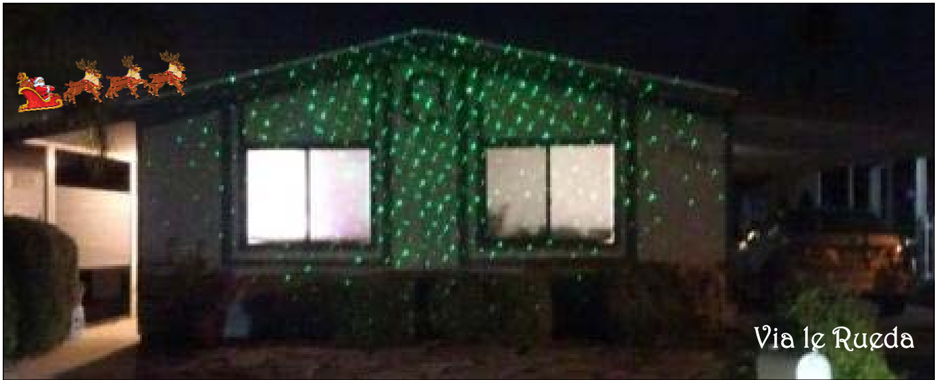
Via la Rueda