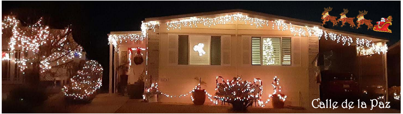
Calle de la Paz