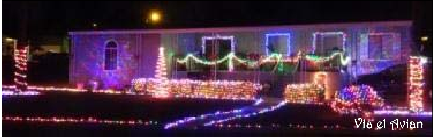
Via el Avian