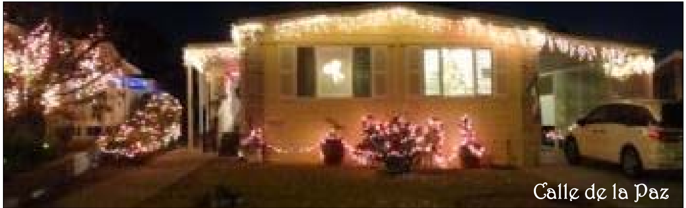
Callz de la Paz