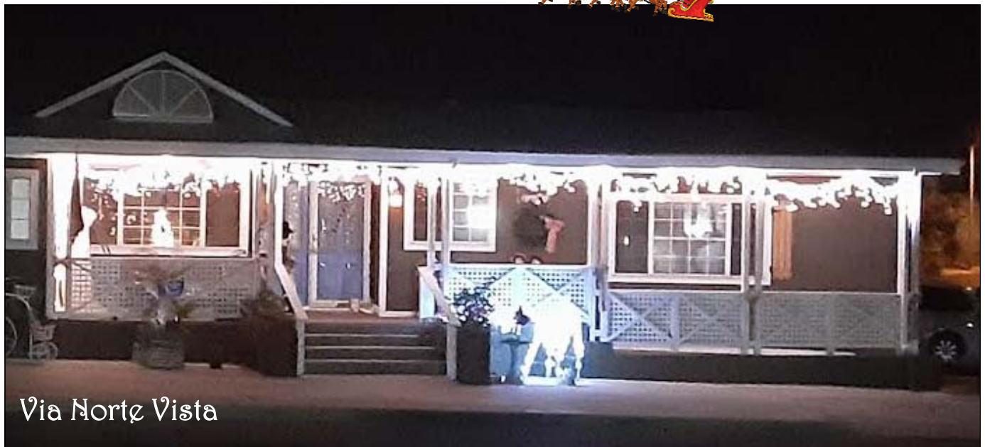
Via North Vista