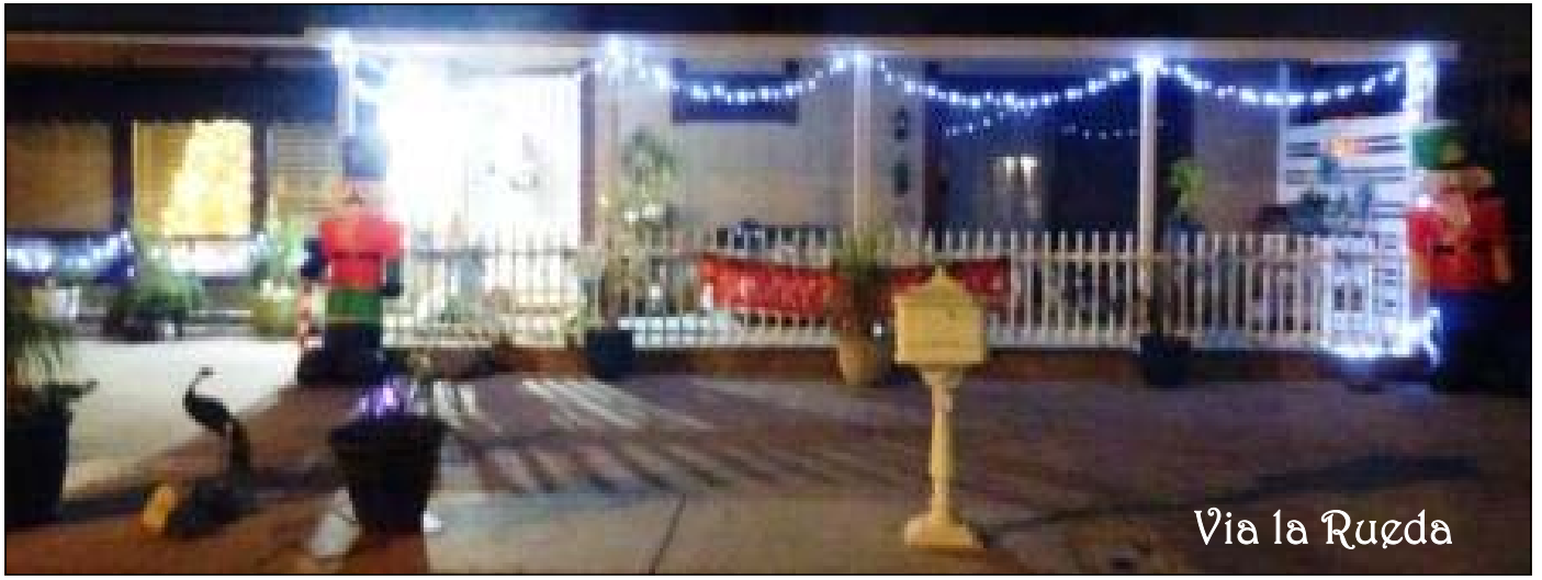
Via la Ruzda