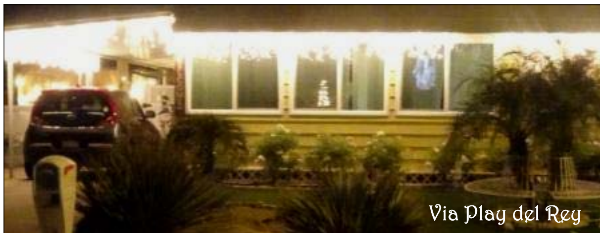
Via Play del Rey