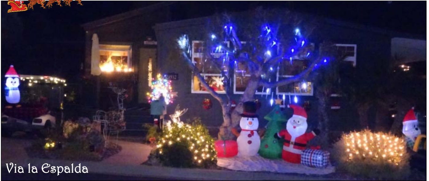
Via la Espalda