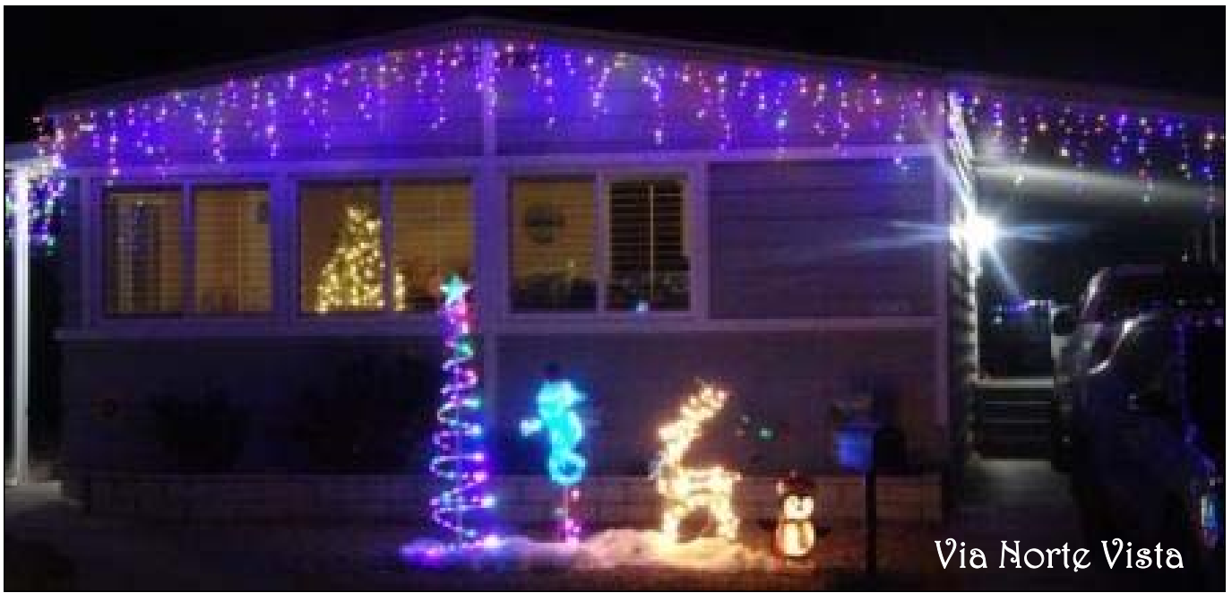
Via North Vista