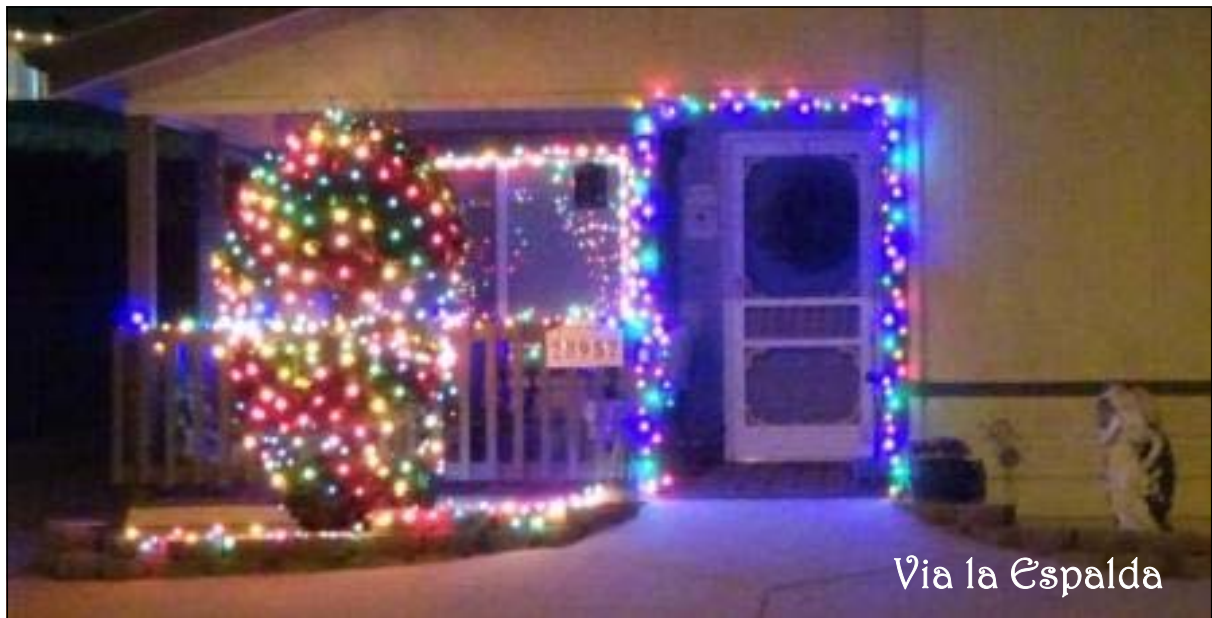
Via la Espalda