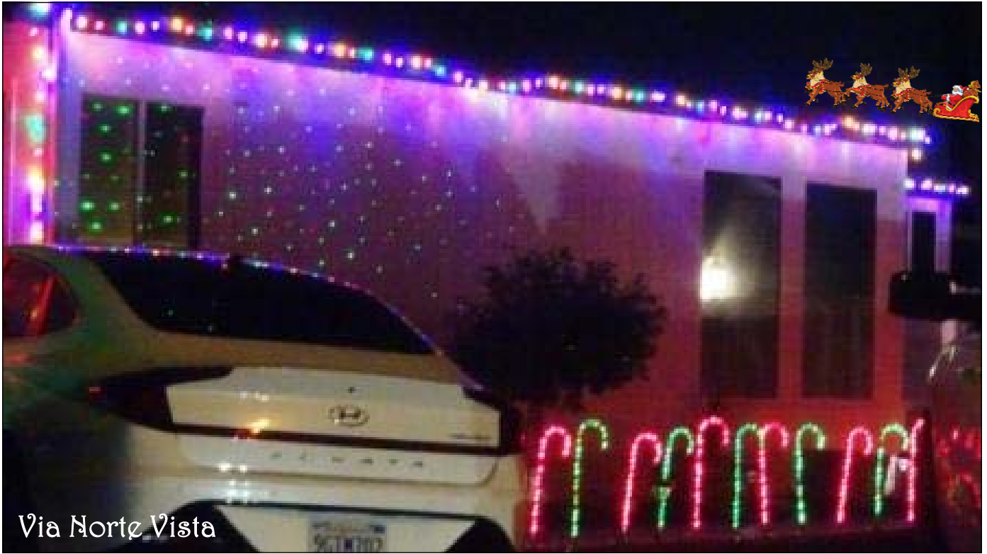
Via Norte Vista