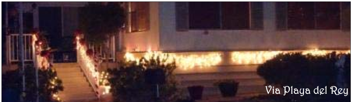
Via Playa del Rey