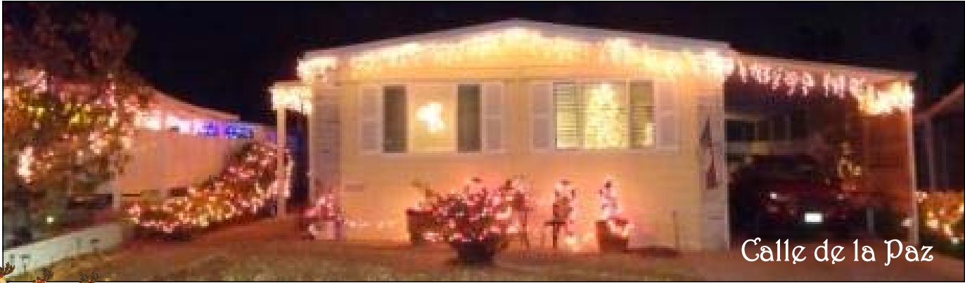
Calle de la Paz