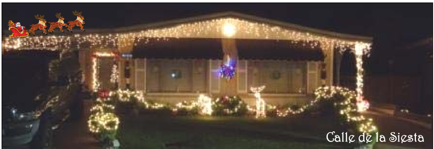
Callę de la Sięsta