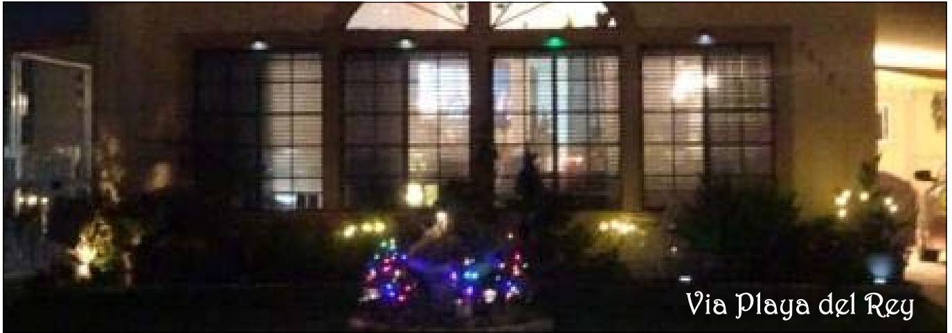
Via Playa del Rey