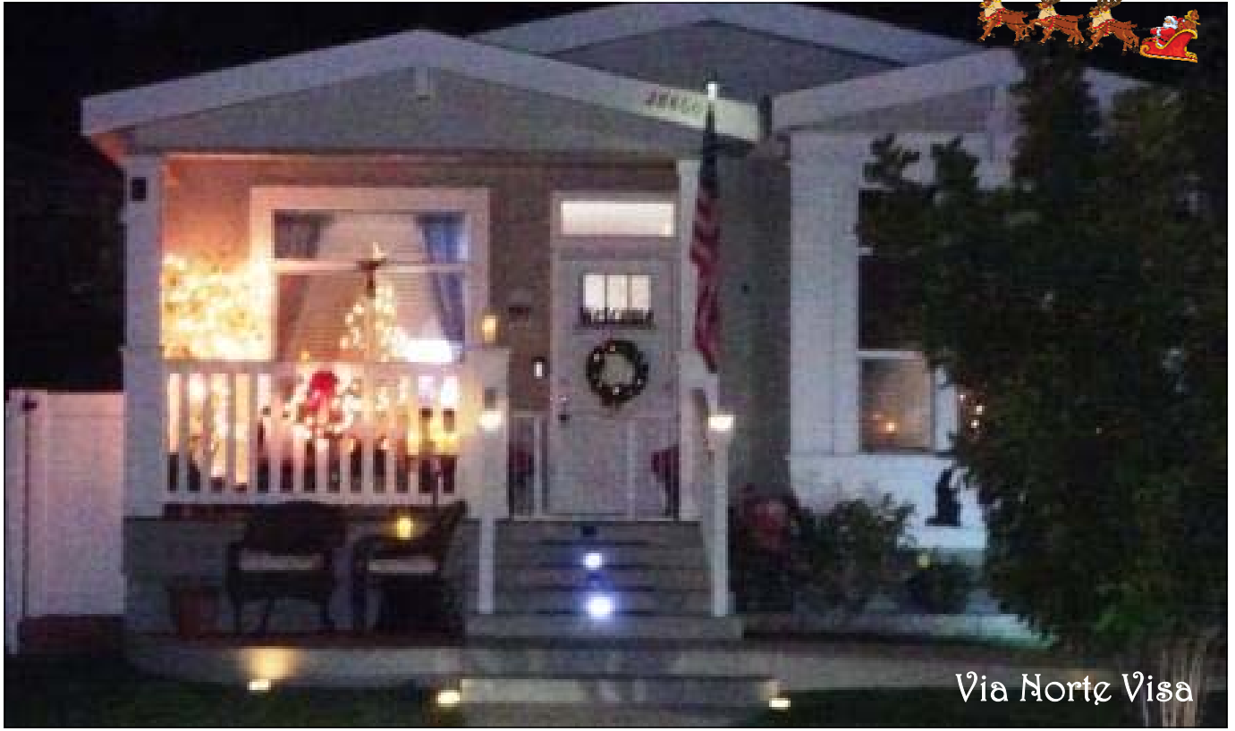
Via Norte Visa