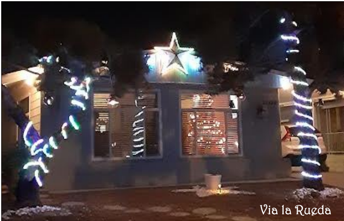
Via la Ruęda