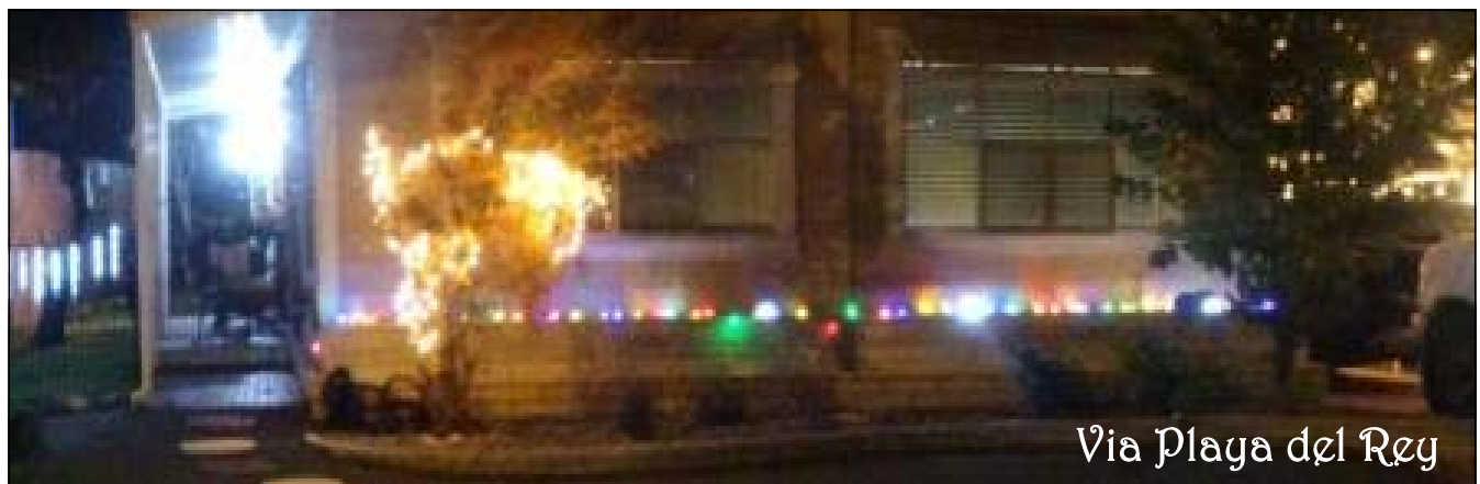
Via Playa del Rey