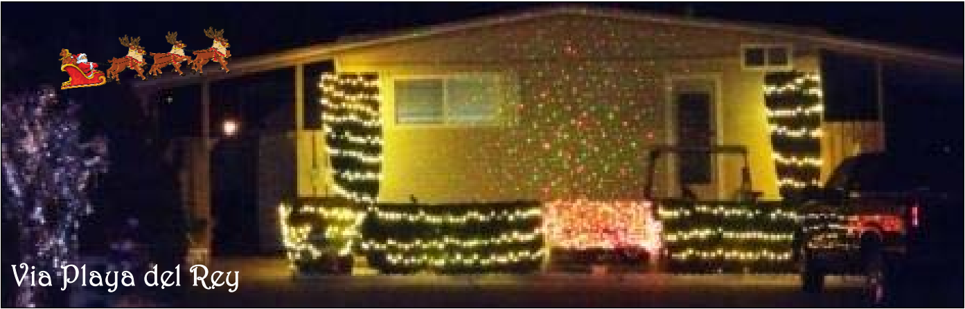
Via Playa del Rey