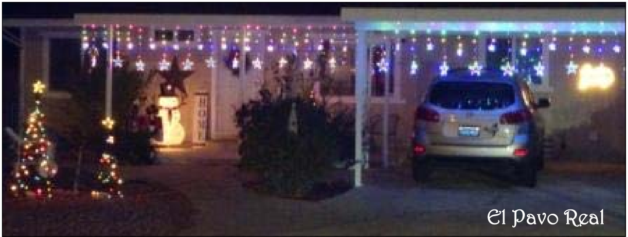
El Pavo Real