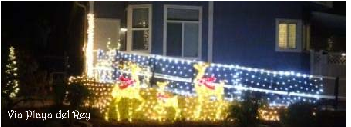
Via Playa dęł Ręzy