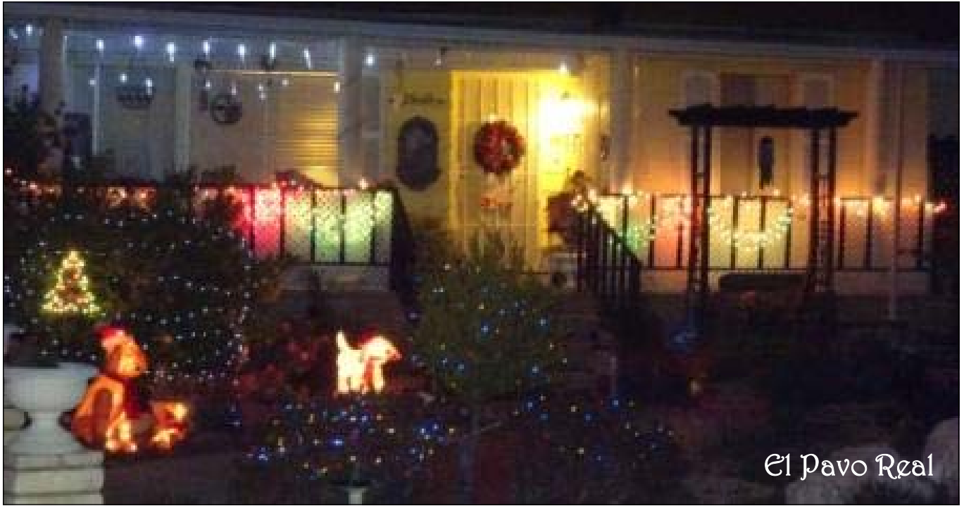
El Pavo Real