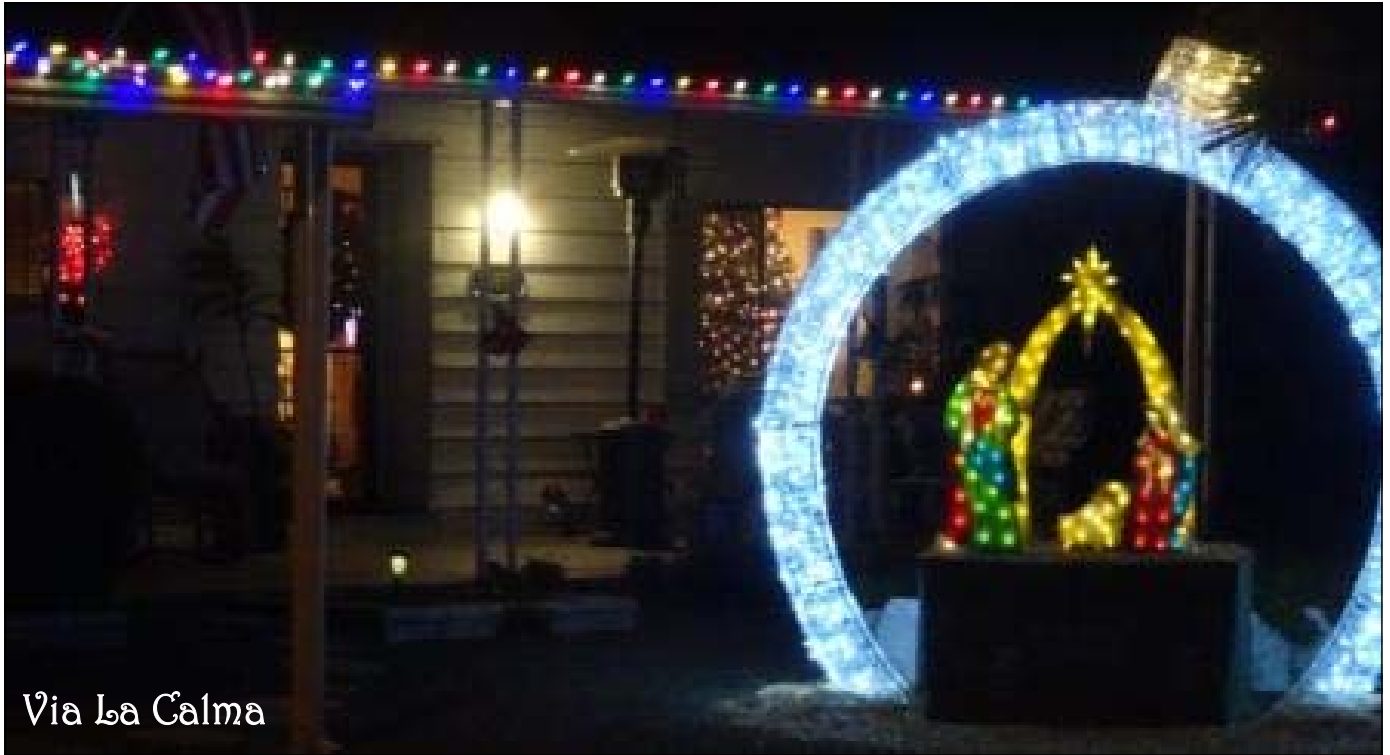
Via La Calma