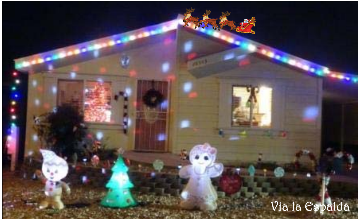
Via la Espalda