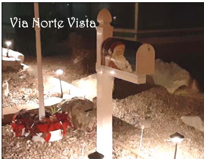
Via Norte Vista