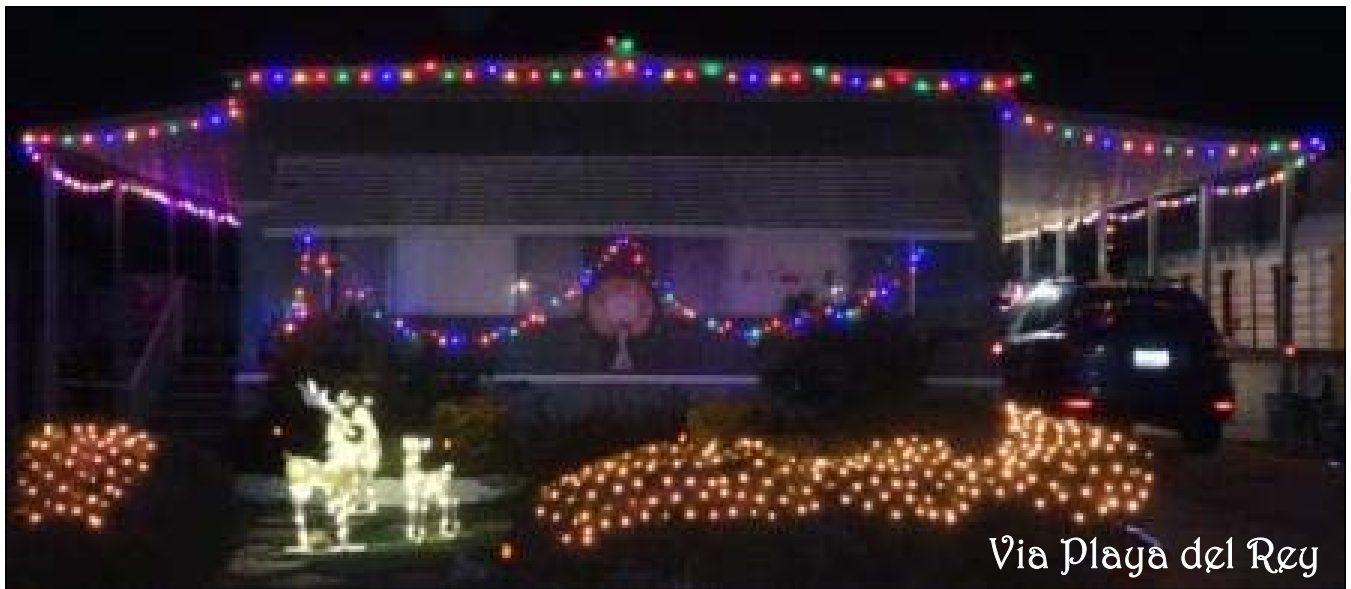
Via Playa del Rey