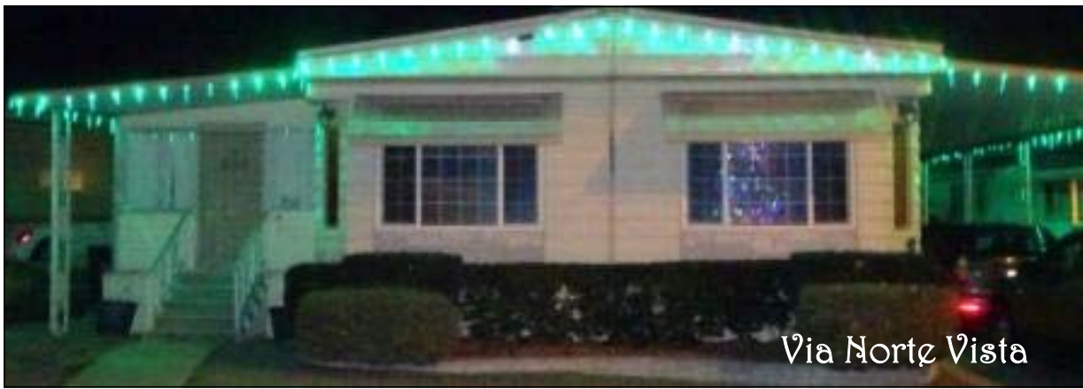
Via Norte Vista