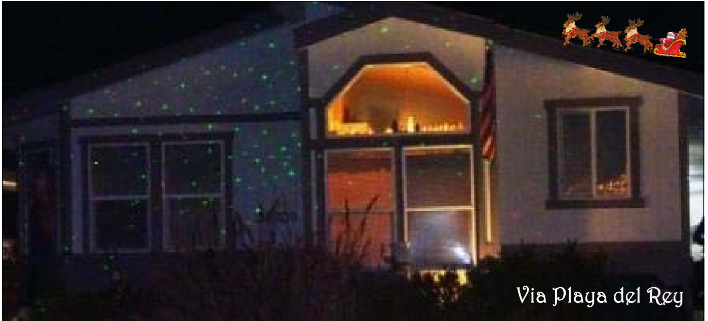
Via Playa dęł Ręzy