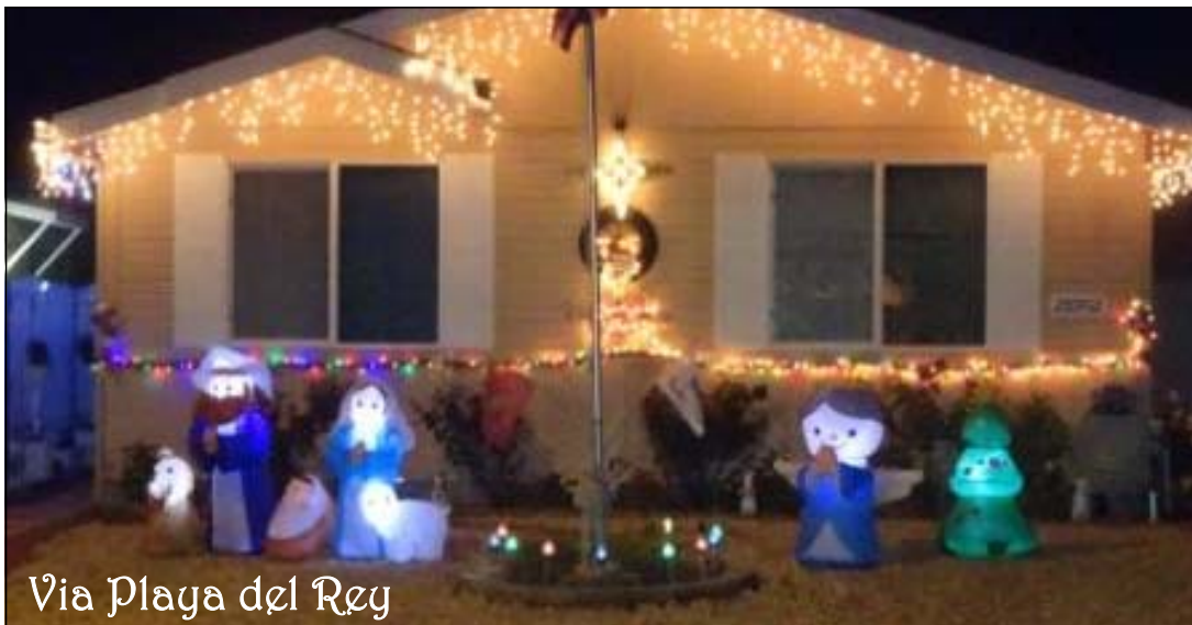
Via Playa del Rey