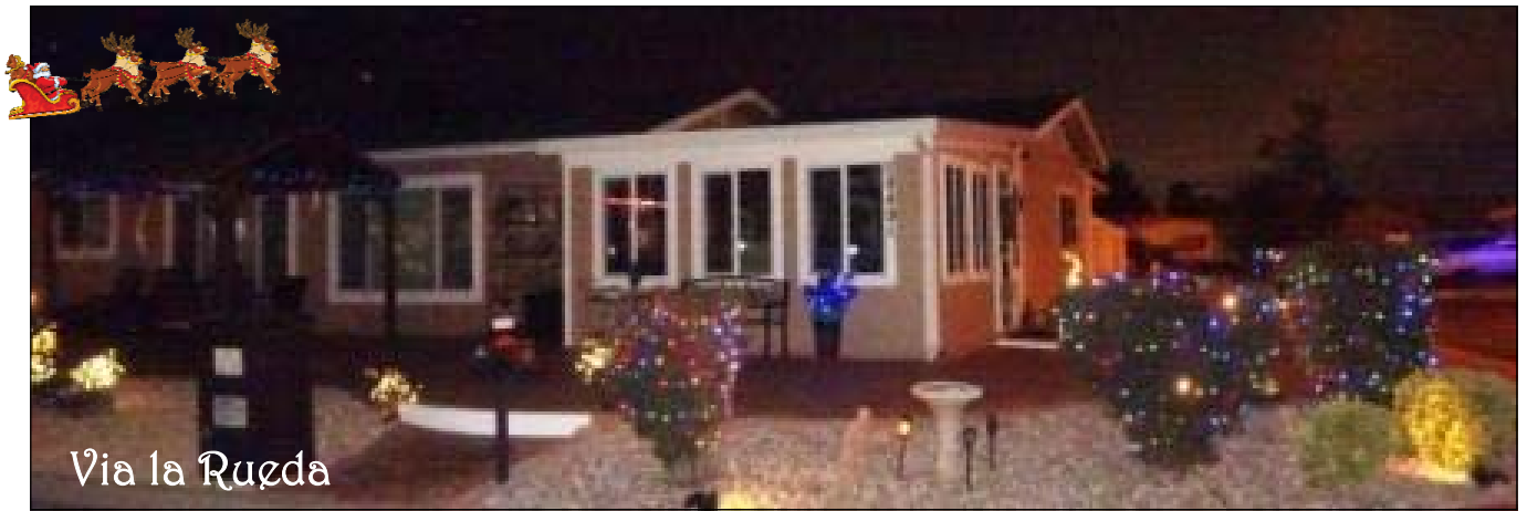
Via la Rueda