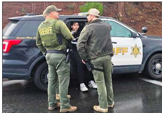
PURSUIT ENDS: (Left) Deputies handcuff suspect wanted in an assault case after he crashed into a retaining wall on Via Princesa, ending a high-speed pursuit on Feb. 14. (Above) Sheriff and Murrieta PD cars gather on Via Princesa after the pursuit ends, while deputies confer as the arrested suspect (seated) awaits transport.