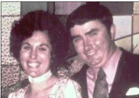
Valentine’s Day 1972