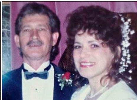
Valentine’s Day 1992