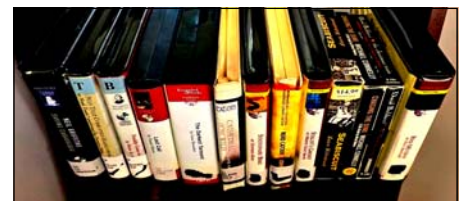
AUDIO BOOKS: Nearly two dozen audio books on CDs are available at the Spring Knolls Library. Donations are welcome.

If you'd like to help the collection, please place any audio books in the book return basket inside the library.